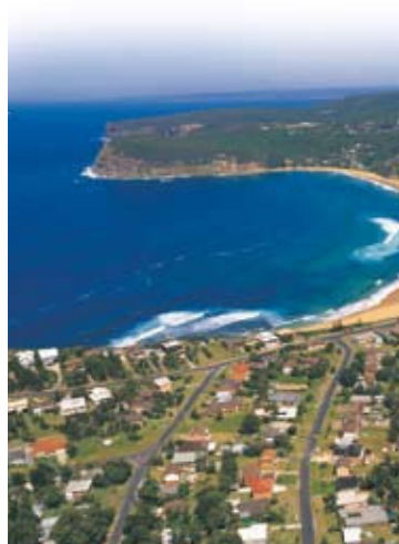
Access All Areas

A fishing expedition or leisurely cruise is an easy way to get out on the water. Join Estuary Fishing and Tours, at your choice of location, and explore the Coast's secluded bays and inlets or arrive at your waterfront destination in style with a water transfer.